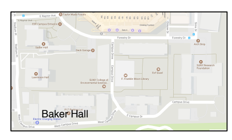
Directions to ESF (<u>http://www.esf.edu/maps/)</u>

or mail a check ($50 registration fee plus $35 for dinner) to: SUNY-ESF, ATTN: 2017 Chestnut Meeting, ESF Outreach, 1 Forestry Dr., 235 Gateway, Syracuse, NY 13210