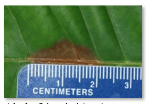
After 3 to 7 days, dead tissue is measured and compared to Chinese and American chestnut controls.