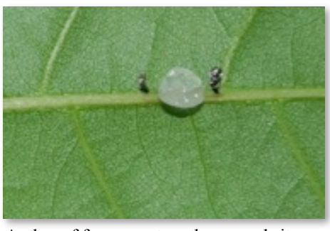
A plug of fungus put on the wound site.