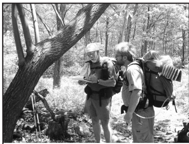
Figure 1: New Jersey American chestnut north of Sunfish Pond.

By utilizing the concept of the transect, this pilot study set out to better define best practices for establishing 1) a baseline snapshot of chestnut density along the Appalachian Trail and 2) a data set from which those variables that define chestnut occurrence could be extracted. In addition, by incorporating the use of volunteer citizen scientists, the project has an added benefit of increasing awareness not only among project participants, but also several communities of hikers, naturalists, and residents along the trail.