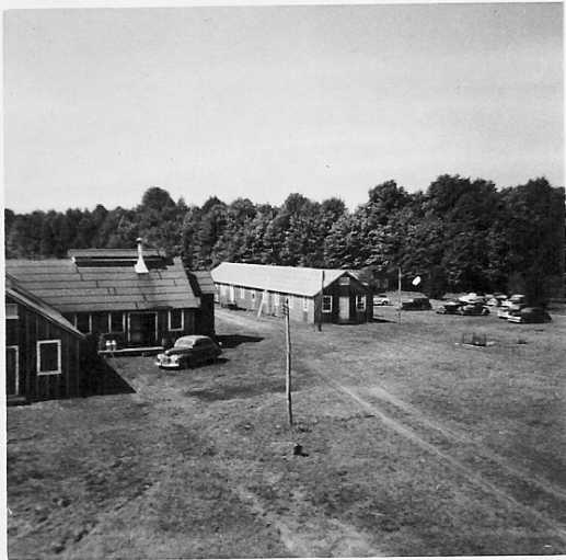
I believe this was the mess hall (to the left).