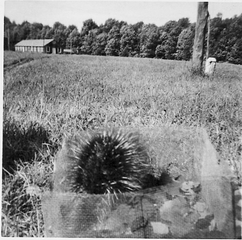
We even caught a porcupine!