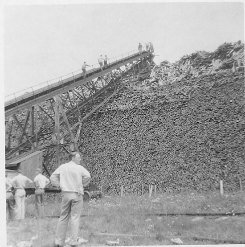
As I recall, we visited a paper mill wood storage yard in a nearby town whose name escapes me.