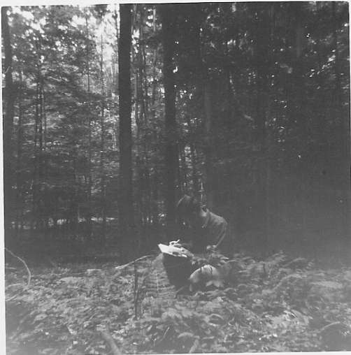
Actually, the project was to survey (and then draw up) a proposed road.