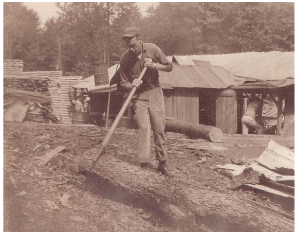
Walter Gabel – rolling logs at mill