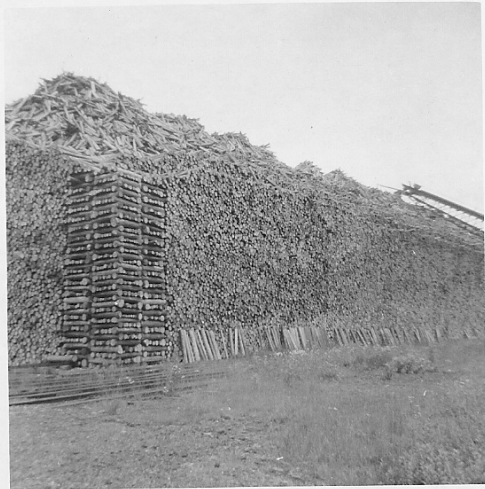
Paper mill wood storage yard.

Heinz Heinemann '50 Pennswood Village G103 1382 Newtown Langhorne Rd. 1382 Newtown, PA 18940 hjhpv@aol.com September 2011