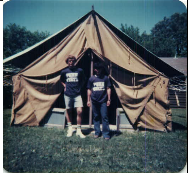
1977 Youth Forestry Camp at Stone Valley