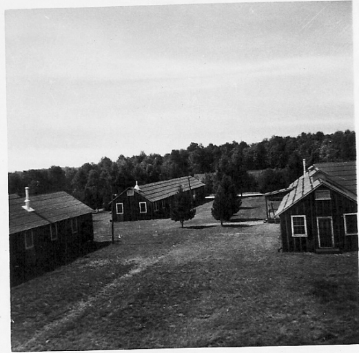
Another view of the buildings.