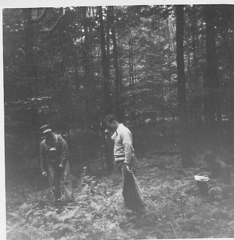
"Practicum" in the forest.