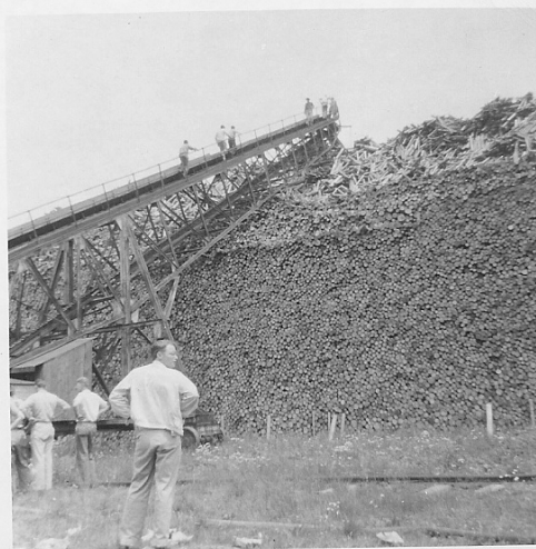
As I recall, we visited a paper mill wood storage yard in a nearby town whose name escapes me.