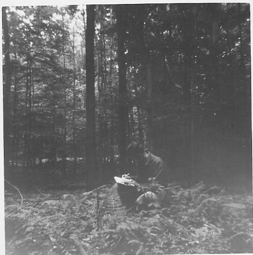
Actually, the project was to survey (and then draw up) a proposed road.