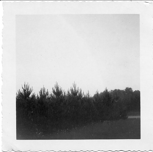
Tree plantation was in back of the buildings – no doubt planted by the CCC.