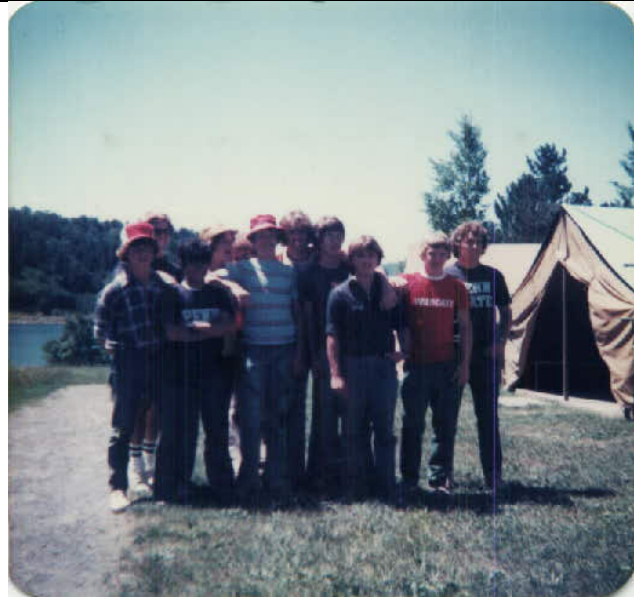
1977 Youth Forestry Camp at Stone Valley