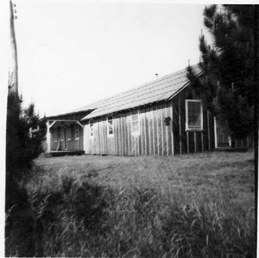
Typical CCC building.