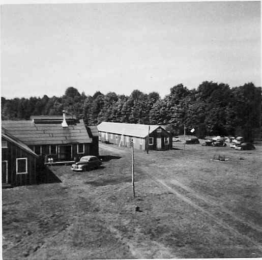
I believe this was the mess hall (to the left).