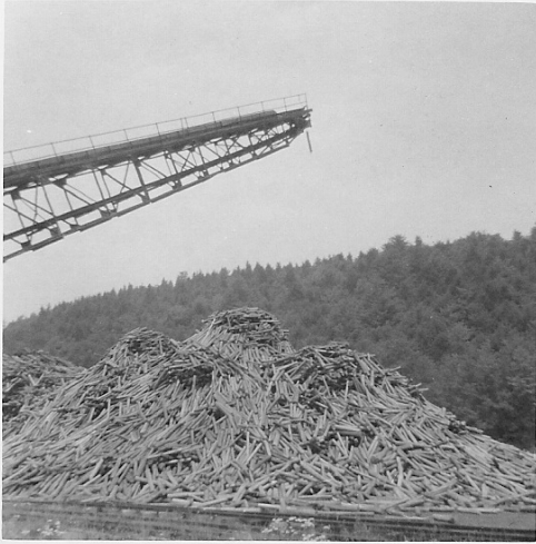
Paper mill wood storage yard.