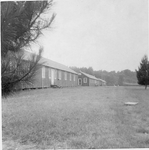
Camp Blue Jay - barracks. It was a former CCC Camp.