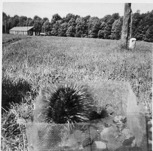
We even caught a porcupine!