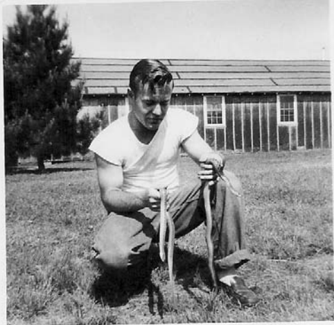
Barracks, with one of the men and the snakes he caught.