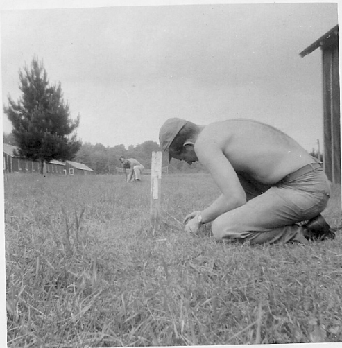
And practiced surveying.