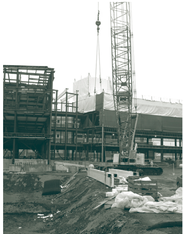
The third beam is readied for placement.

These beams are a unique symbol of the strength in Pennsylvania's wood industry, and the effective research ties between Penn State and this important industry. 🌲