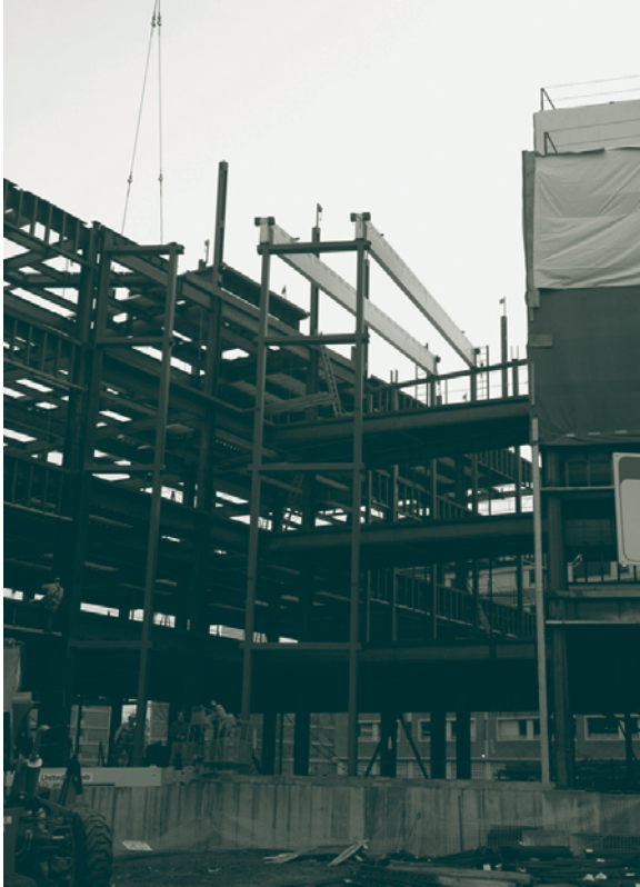
Two of the four red maple laminated beams in place in the new Forest Resources Building.

On January 4, 2005, the Gilbane Building Company completed installation of four red maple laminated beams as the primary roof supports for the four-story atrium in the new Forest