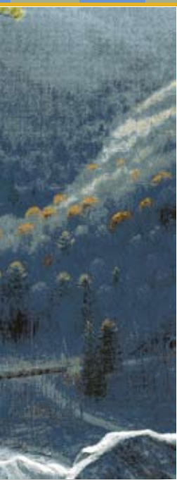
Allegheny woodrats (above) and blue jays (left) are native to Pennsylvania. Humans overhunted them both when there were few laws to protect wildlife.

Plant roots take these up to help the plant grow. Plants need gases from the air, like carbon dioxide, to make food in their leaves. Plants also need energy from sunlight to make this food. When they have what they need, plants can live and grow in their habitat. Each type of plant has a habitat that suits it best. Cattail plants need lots of water and sun. They grow on the edges of ponds and wetlands where their roots are always wet. Prickly pear is a cactus plant that prefers dry, rocky habitat on hillsides or in deserts. It does not need much water.