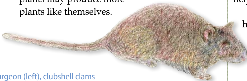
Allegheny woodrats (left), clubshell clams and blue jays (right) are species that are now endangered in the Allegheny region. Things such as dam building, water pollution, and diseases changed their habitat.

For example, if one kind of plant does not get enough water where it grows, it will die. But, a few of its kind might survive a dry spell if they have extra wax on their leaves. This wax helps a plant hold water in its leaves. The surviving plants may produce more plants like themselves.