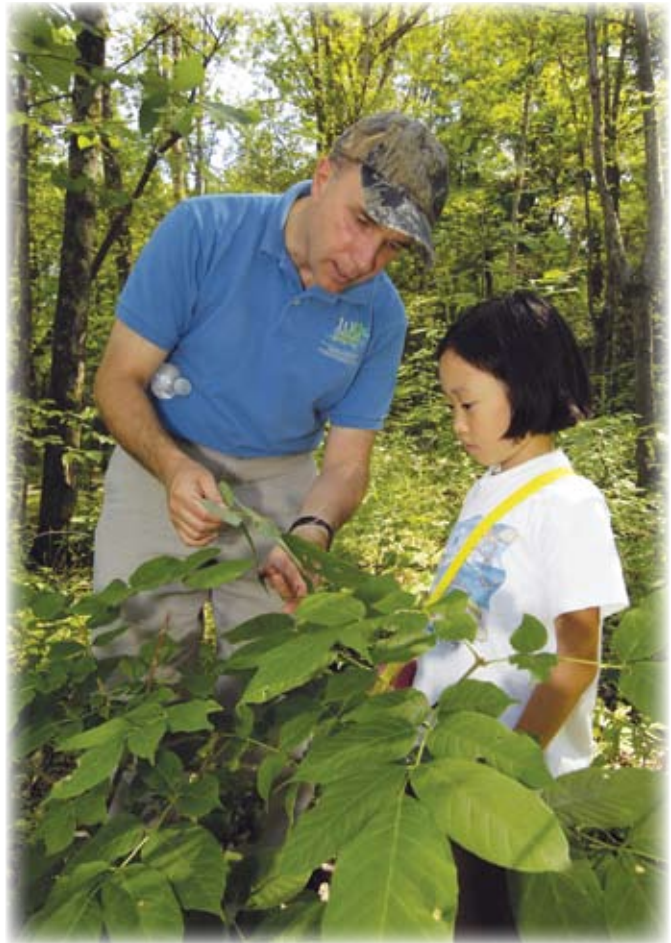
Many kinds of forest trees are adapted to growing in the shade when they are young. Why might their leaves be bigger when growing in the shade?

Many of these new plants may have their parents' trait of extra wax. They will be better able to survive dry times in the future. Over long periods, sometimes thousands of years, plants and animals slowly adapt to their habitat. This helps them survive a changing habitat.