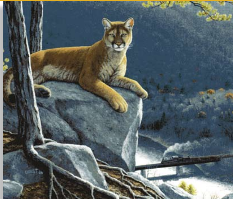
Lion Tracks painting by Dan Christ

Plants need different things from their habitat. They need water and nutrients from the soil.