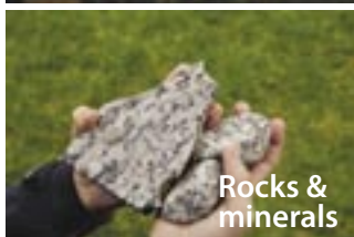
Rocks & minerals