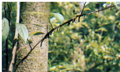
Figure 10.—Flooding of tupelo swamps during the larval feeding period prevents natural enemies from reaching the forest tent caterpillars.