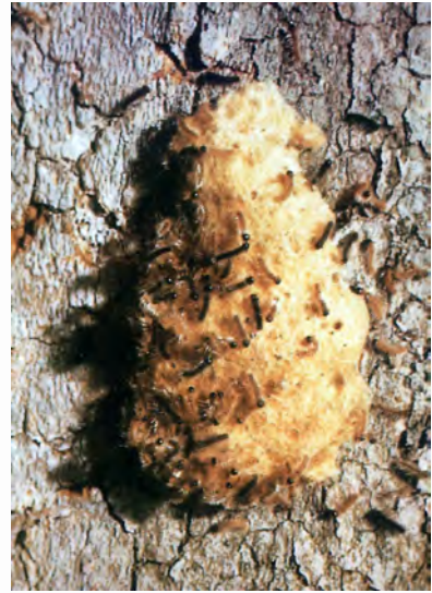
Figure 3 —Gypsy moth larvae emerging from egg mass.

host trees on silken threads (fig. 4) are carried by the wind for a distance of about 1 mile. Larvae can be carried for longer distances. Artificial dispersal occurs when people transport gypsy moth eggs thousands of miles from infested areas on cars and recreational vehicles, firewood, household goods, and other personal possessions.