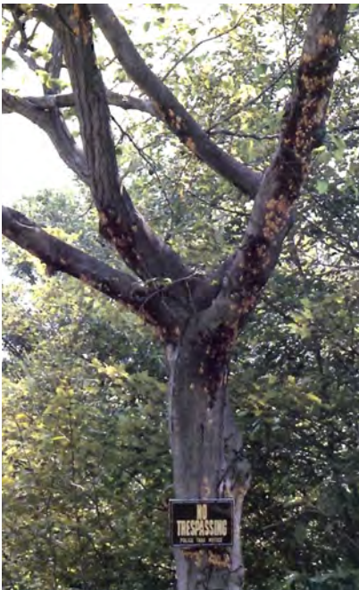
Figure 2 —Gypsy moth egg masses on the trunk and branch of a tree.

Larvae are dispersed in two ways. Natural dispersal occurs when newly hatched larvae hanging from