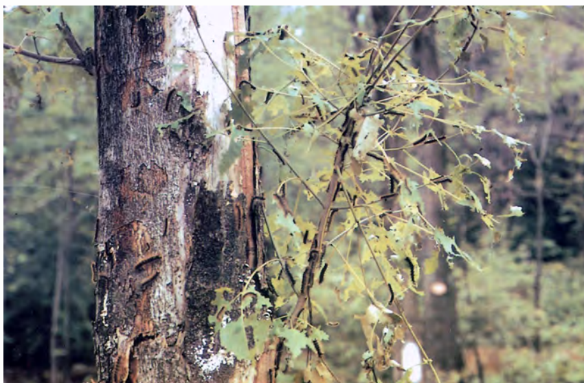
Figure 7 — A tree stripped by gypsy moth larvae.

Four to six weeks later, embryos develop into larvae. The larvae re- main in the eggs during the winter. The eggs hatch the following spring.