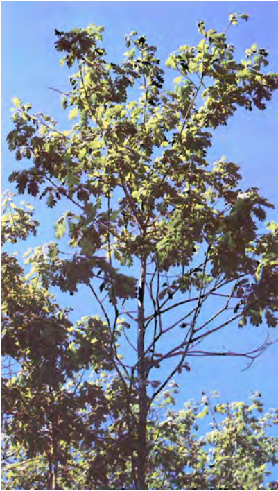
Figure 11 — Tree before defoliation.