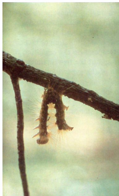
Figure 13—Larvae infected by the nucleopolyhedrosis virus (NPV) hanging in an inverted "V" position.

Wilt disease caused by the nucleopolyhedrosis virus (NPV) is specific to the gypsy moth and is the most devastating of the natural diseases. NPV causes a dramatic collapse of outbreak populations by killing both the larvae and pupae. Larvae infected with wilt disease are shiny and hang limply in an inverted "V" position (fig. 13).