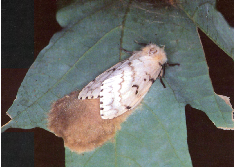
Figure 10 — Female gypsy moth laying eggs.