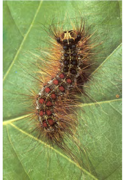
Figure 5 — Older gypsy moth larvae showing five pairs of raised blue spots and six pairs of raised brick-red spots.

tween mid-June and early July. They enter the pupal stage (fig. 8). This is the stage during which larvae