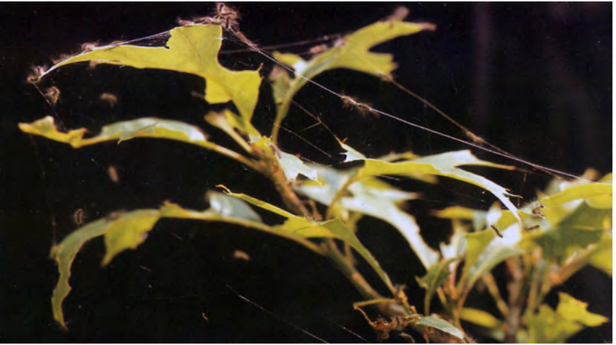
Figure 4 — Gypsy moth larvae suspended on silken threads.

leaves (fig. 6). The second and third instars feed from the outer edge of the leaf toward the center.