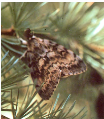
Figure 9— Male gypsy moth.