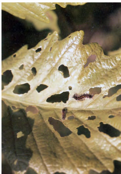
Figure 6 — First instar gypsy moth larvae chewing small holes in leaves.

change into adults or moths. Pupa- tion lasts from 7 to 14 days. When population numbers are sparse,