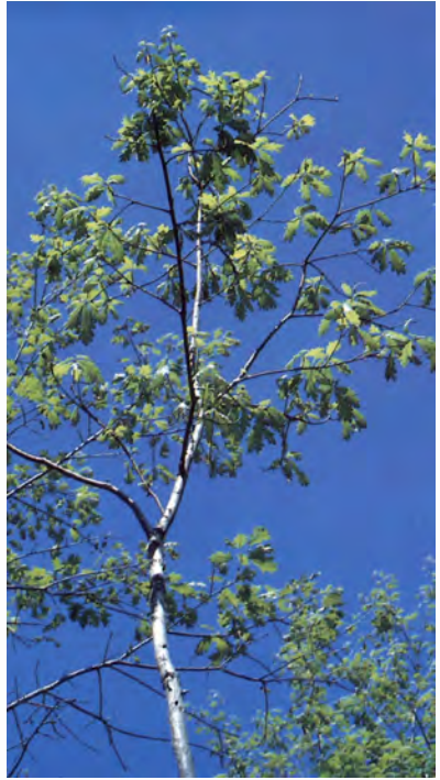
Figure 12 — Tree after refoliation.