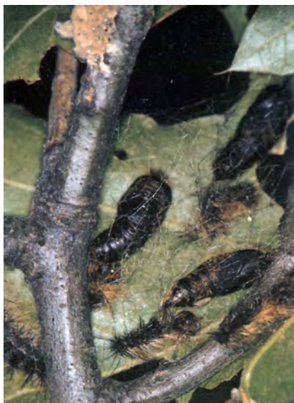
Figure 8— Gypsy moth pupa.