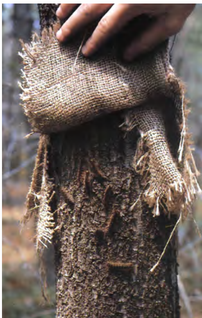
Figure 14 — Gypsy moth larvae and pupae under burlap.