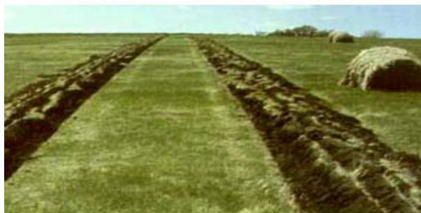
Figure 1. Strip Tillage on Native Sod