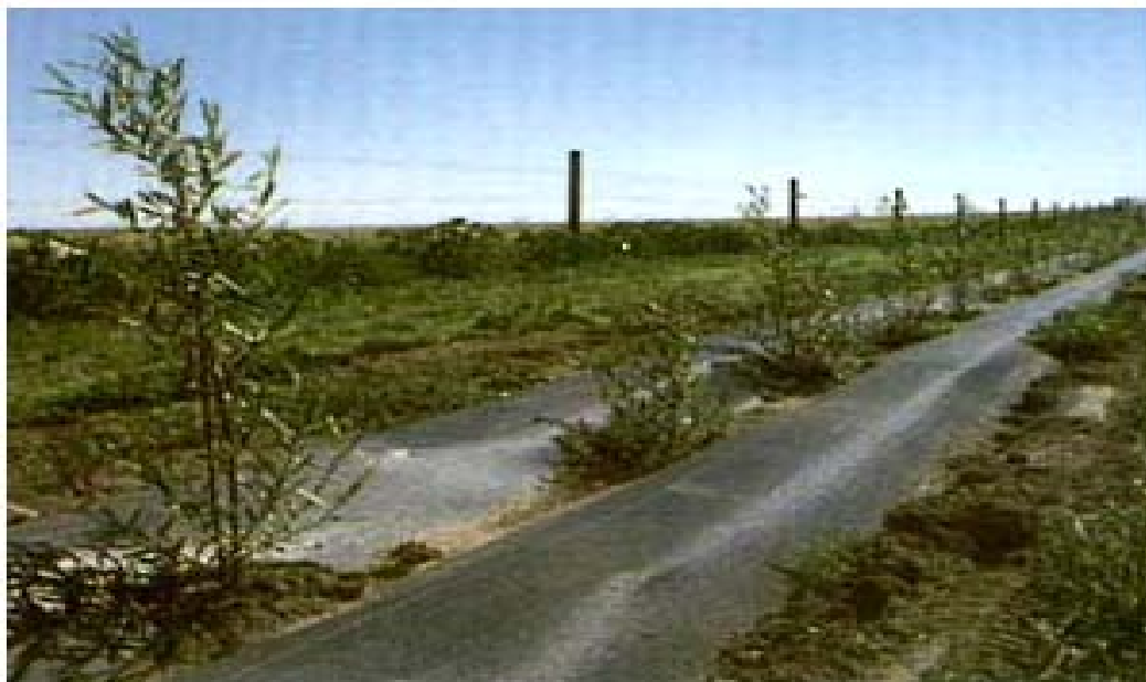
Figure 3. Example of Option 1 - Anchoring Six-Foot Wide Continuous Fabric Mulch Using Soil along the Edges