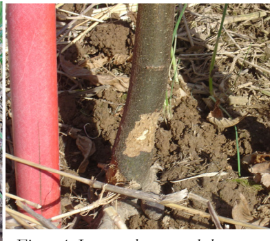
Figure 4. Improperly protected chestnut stems are open to attack by various creatures. The tree on the left shows signs of groundhog attack. The tree on the right

shows signs of vole attack. Protect the young saplings from a number of hungry vegetarians with the use of plastic tree shelters. The stems are almost completely girdled and also now have wounds that are open to significant blight infection. Also remember that vole attacks tend to be worse in field situations vs. forested ones.