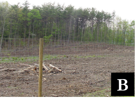
Figure 1. An open field (A) can be an ideal place to start your chestnut trees. Be sure to manage the sod cover. A recently clearcut area (B) can also be a fine place to start an orchard. The soils are often fertile and the site will have less weed/grass competition than a field.

1. Site selection: Well-drained, acidic soil type. This is *the* most important