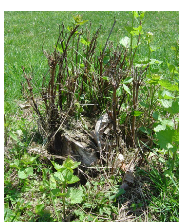
Figure 3. Continued deer browse of sprouts from an American chestnut stumb.

For tree plantings to be most successful, the deer population should be managed concurrently with the habitat. Balancing the deer herd with what the habitat can