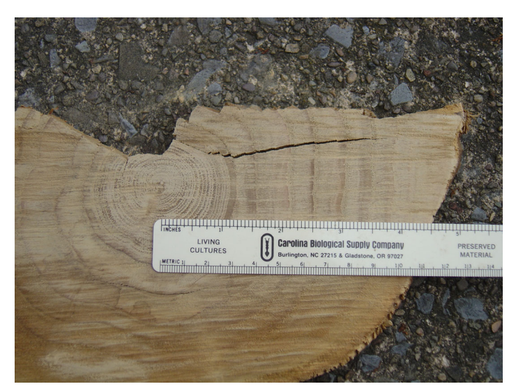
Figure 2. Chestnut growth in response to release. This cookie, taken from a tree in western PA, shows very little growth for the first 32 years. Following a thinning, the tree grew almost 1" diameter per year for the next 8 years.

Many areas within the native range of American chestnut may be defined as an abandoned mine land (AML). Depending on the way the site was reclaimed, reforestation may be more or less difficult. TACF