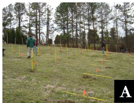
Figure 1. An open field (A) can be an ideal place to start your chestnut trees. Be sure to manage the sod cover. A recently clearcut area (B) can also be a fine place to start an orchard. The soils are often fertile and the site will have less weed/grass competition than a field.