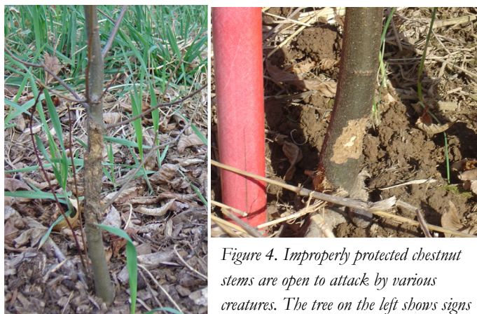
Figure 4. Improperly protected chestnut stems are open to attack by various creatures. The tree on the left shows signs of groundhog attack. The tree on the right shows signs of vole attack. Protect the young saplings from a number of hungry vegetarians with the use of plastic tree shelters. The stems are almost completely girdled and also now have wounds that are open to significant blight infection. Also remember that vole attacks tend to be worse in field situations vs. forested ones.

Chestnuts are a prized food of many species, humans not being the least of them. Blue jays, turkeys, bears, deer, voles, mice, squirrels, chipmunks, raccoons —