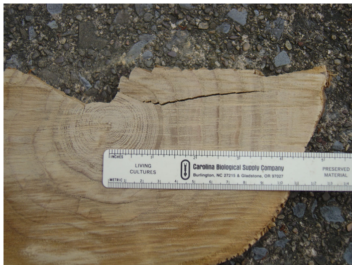
Figure 2. Chestnut growth in response to release. This cookie, taken from a tree in western PA, shows very little growth for the first 32 years. Following a thinning, the tree grew almost 1” diameter per year for the next 8 years.

TACF often recommends that new growers start by testing their growing methods and land by planting 10 - 50 wild-type American chestnuts before planting many and/or implementing large-scale planting projects. This “trial run” can be a very valuable exercise to learn the finer points of growing chestnuts.