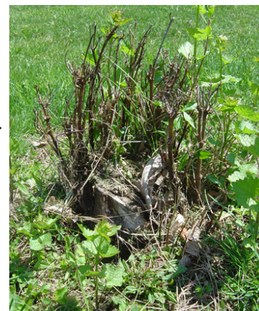
Figure 3. Continued deer browse of sprouts from an American chestnut stump.

Balancing the deer herd with the habitat is achieved by annually removing antlerless deer. The appropriate antlerless harvest rate varies by region, but you can calculate a target antlerless harvest by using an estimate of the deer herd or of your habitat quality. Numerous population models suggest a harvest of 20 to 30 percent of the adult does (not fawns) in a population will stabilize the herd. If your goal is to increase the herd, harvest fewer than 20 to 30 percent of the does. If your goal is to decrease it, harvest more than this percentage. If you do not have an estimate of the number of deer in your area, you can use ballpark