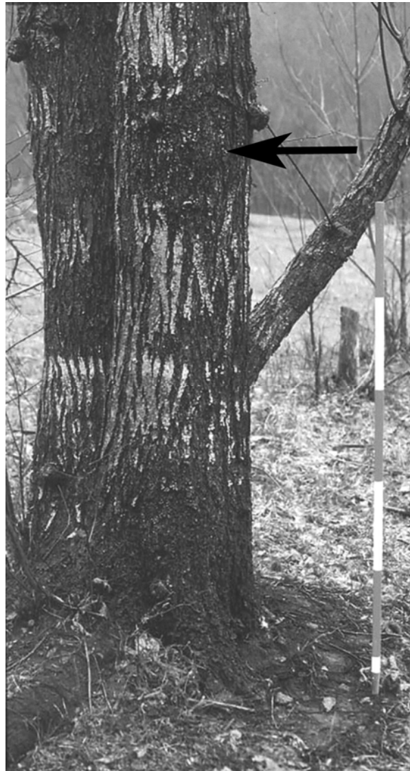
Figure 3. Integrated blight control on American chestnut with resistance and hypovirulence. Photo taken in March, 2004 of a 19.0-inch dbh stem (left) and an 18.5-inch dbh stem (right) of a two-stem American chestnut tree grafted in 1980 from a large survivor and later inoculated with a mixture of hypovirulent strains of the blight fungus. Arrow points to a highly superficial (nonkilling) canker. This high level of blight control is typical throughout this tree, which is over 60 feet tall. Bars on scale to right are 1 foot long.

A few predominantly orange-pigmented isolates from the grafts had high dsRNA content, and high dsRNA is characteristic of European hypovirulent strains (Dodds 1980). The European hypovirulent strains inoculated on the grafts were of French and Italian origin. The French strain inoculated on the