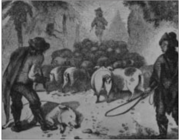
"Drovers" from Harper's, October 1857