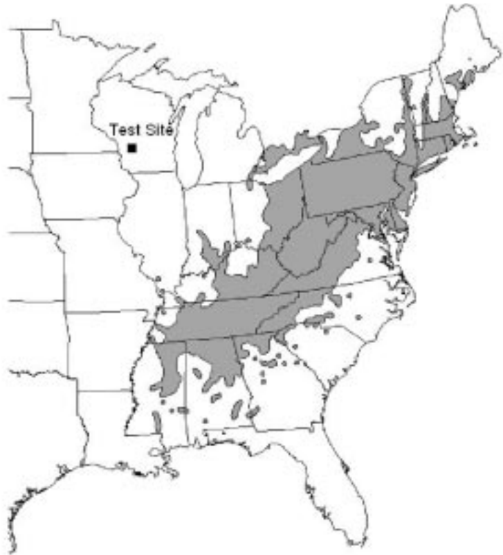
Figure 1. The historical range of American chestnut prior to introduction of chestnut blight (adapted from Saucier, 1973) and the location of the Rockland, WI tree plantation test site.

Use of species with desirable characteristics (i.e., timber production, wildlife value, and aesthetics) may help to maintain reclaimed sites as forestland for the long-term. At present, species that are tolerant to degraded conditions, yet relatively undesirable to landowners, such as black locust ( Robinia pseudoacacia ) and green ash ( Fraxinus pennsylvanica ), are often used in reclamation projects (Rathfon et al., 2004) (Table 1). Thus, the resulting species composition on reclaimed sites typically reduces the prospective future value of the land. A potential new species option for reclamation projects, which has not been considered in the past, is American chestnut ( Castanea dentata ).