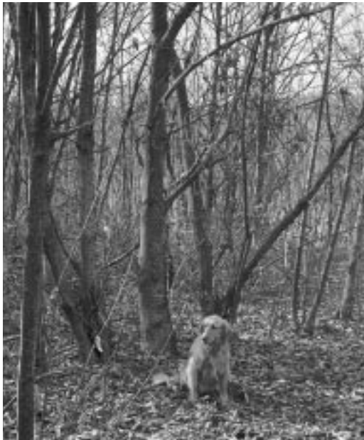
Figure 1. Highly blight-resistant Chinese to American B_1 - F_2 , 13 years old, 11 years after inoculation with Cryphonectria parasitica . The tree is to the left of and behind the dog.

Three-year-old B_2 - F_2 progenies from controlled crosses between selected straight B_2 s (backcrossed to American chestnut) were inoculated in June, 2003, and cankers measured in November. 'Clapper' B_2 - F_2 progeny were from a single cross between two half sibs, while 'Graves' B_2 - F_2 progeny were a composite of three crosses between half sibs. Depending upon their size, these trees were inoculated once or twice each with strains Ep 155 and SG1 2-3, using the cork borer, agar-disk method, but the holes were 4 mm in diameter. A larger cork borer and number of inoculations were used in 2003 than in 1993 because 2003's 3-year-old trees were larger than 1993's 2-year-old trees. Again, highly blight-resistant progeny were recovered, this time from second backcross F_2 s (Table 5). Thus, not only could highly blight-resistant progeny be recovered by intercrossing F_1 interspecific hybrids or by intercrossing first or second backcrosses to American chest-