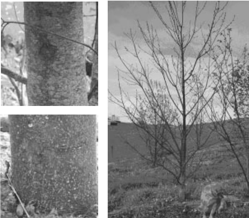
Figure 2. Left, chestnut blight cankers after two growing seasons on a highly blight-resistant 'Clapper' B 2 -F 2 . Top left, canker incited by strain SG1 2-3. Bottom left, canker incited by strain Ep 155. Right, 4-year-old 'Clapper' B 2 -F 2 . Similar cankers on blight-susceptible American chestnut would be expected to exceed 40 cm in length; these cankers were 2 to 3 cm long.