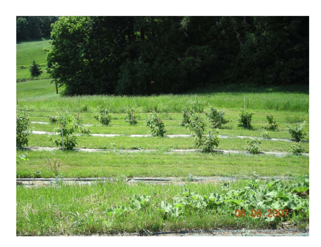
Empty up-hill rows were planted over ledge. Chestnuts sprouted but quickly died.