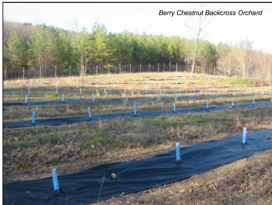
Berry Chestnut Backcross Orchard

YOU CAN SIGN UP FOR THE SPRING MEETING ONLINE AT www.GaTACF.ORG OR CONTACT DIANNE SMITH AT 706+259-9010