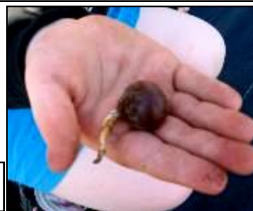
Sprout Lily Chesnut holds a nut destined to be planted in the Berry Backcross Orchard.

Now, thanks to funding from the National Forest Foundation, the orchard has an irrigation system in place. The design of planting nuts directly into the soil follows the belief that the nuts can adapt to site conditions from the start better than potted trees that have been pampered for a year. Plus we are following a formula that other chapters have had success with for a number of years.