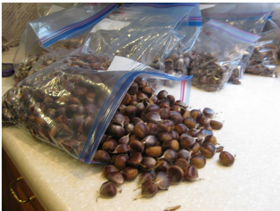
THE FALL HARVEST WAS OUTSTANDING