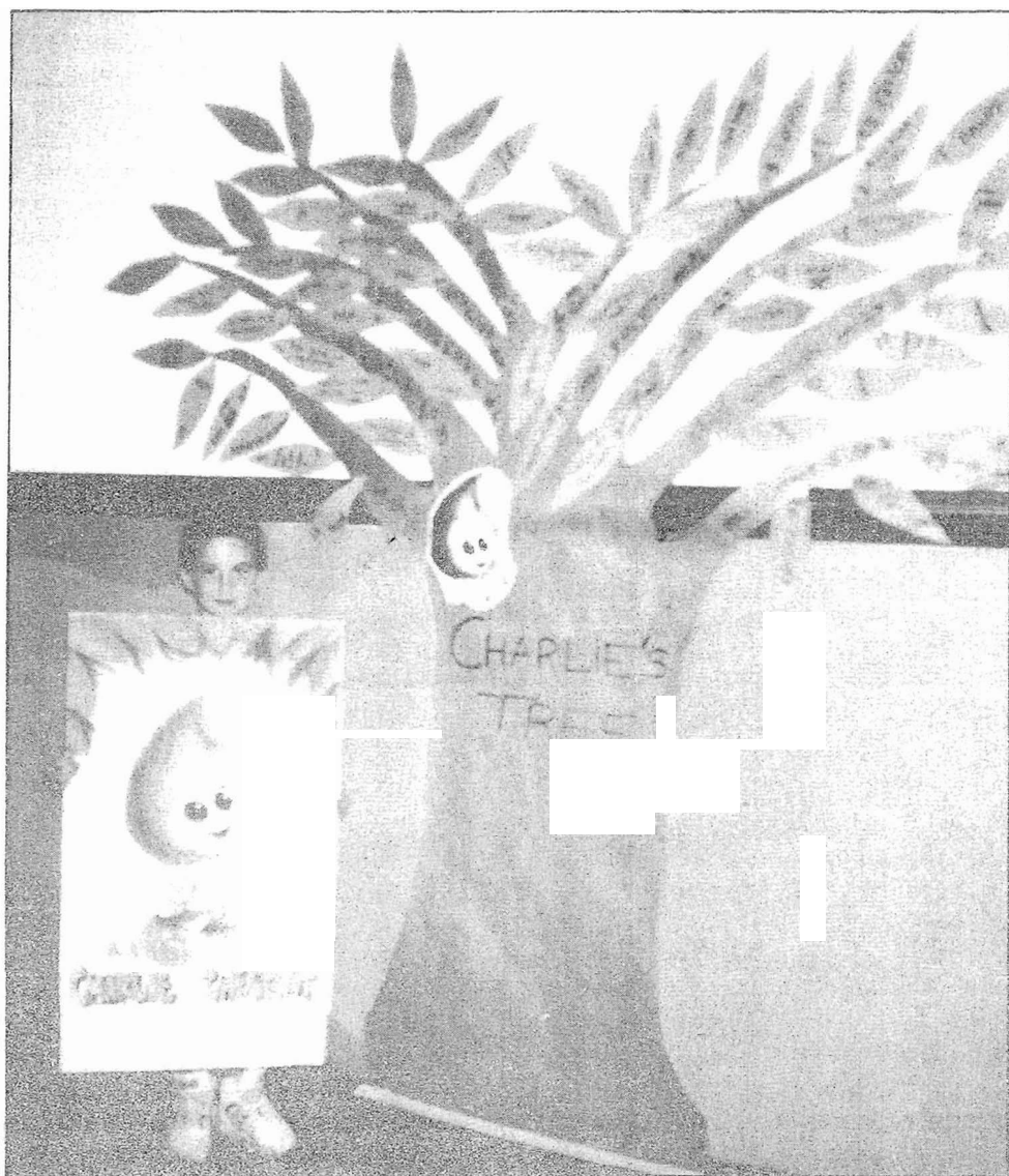
Students at The Hyde Park School pose with Charlie's Tree . On each limb is written a teachers name for their class and on each leaf is written a student's concept of the importance of the American chestnut.