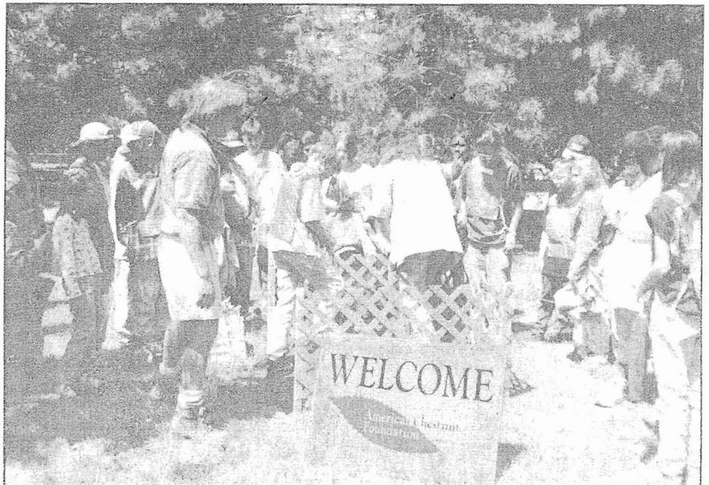
Students and teachers at the Buffalo Zoo Science Magnet School plant American Chestnuts as part of Zoo Day. 1,700 students visited the zoo for these two days of educational programs.

On July 2, 1995, a group of ACF members visited Chestnut Ridge Park and Shale Creek Sanctuary to see chestnut trees in flower. Short hikes were rewarded with the sight of the characteristic creamy catkins and small green pistillate flowers crowning trees of several chestnut species. Participants observed favorite trees from previous walks and shared locations of other American chestnuts, which continue to be found in the park. Early July is an ideal time to locate chestnut trees, as few other trees are flowering at this time. ACF members have used knowledge gained on these walks to find other chestnut trees, to gather Chinese chestnuts for the "traditional" chestnut stuffing; and to enrich our seed orchards with American chestnuts collected from the Shale Creek trees.