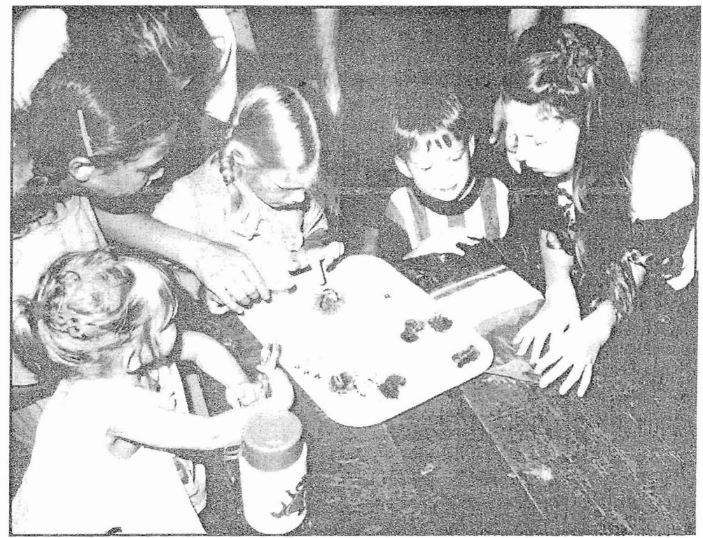
Children test the sharpness of the prickly chestnut bur during educational programs offered at the "American Chestnut Festival".