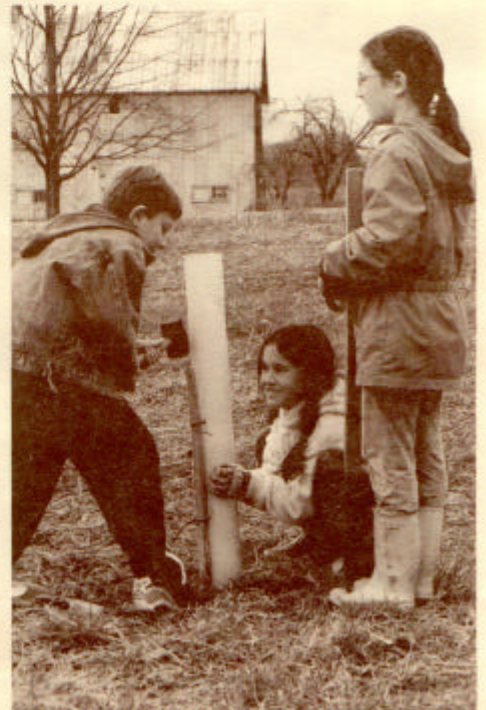
Children of members are enthusiastic "maintainers" at District 9's Planting and Maintenance Day.

The favorite food nuts of the Iroquois were hickory and chestnuts, though other nuts were also valued. Chestnuts were boiled and the mealy interior used for puddings or the dried meats were pounded into flour and mixed with bread meal to give the bread flavor.