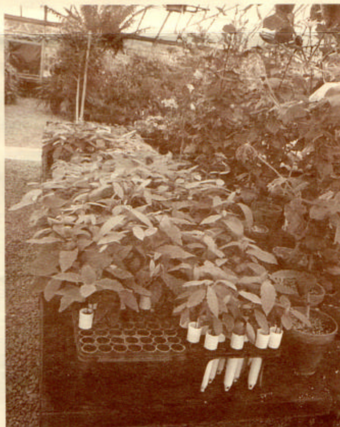
243 American chestnut seedlings were grown for planting in District 3's seed orchards in the greenhouse of the Institute of Ecosystem Studies in Millbrook, NY. Each of the white cone-shaped containers was coded and recorded to indicate the tree and district of the nut's origin.