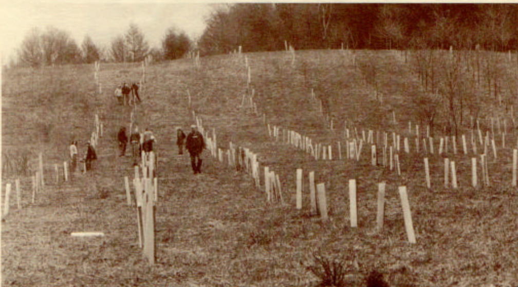
PLANTING DAY AT ZOAR This American chestnut seed orchard is located in the DEC's Multiple Use Area in Western NY's Zoar Valley. District 9 turned out more than 50 hard working volunteers to plant 128 seedlings and repair weather, deer and rodent damage. The seed orchard was established 10 years ago and contains over 800 American chestnut trees.