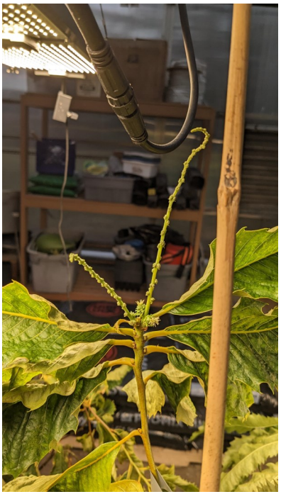
Bisexual catkins forming on D58 hybrid seedling, January 2023.