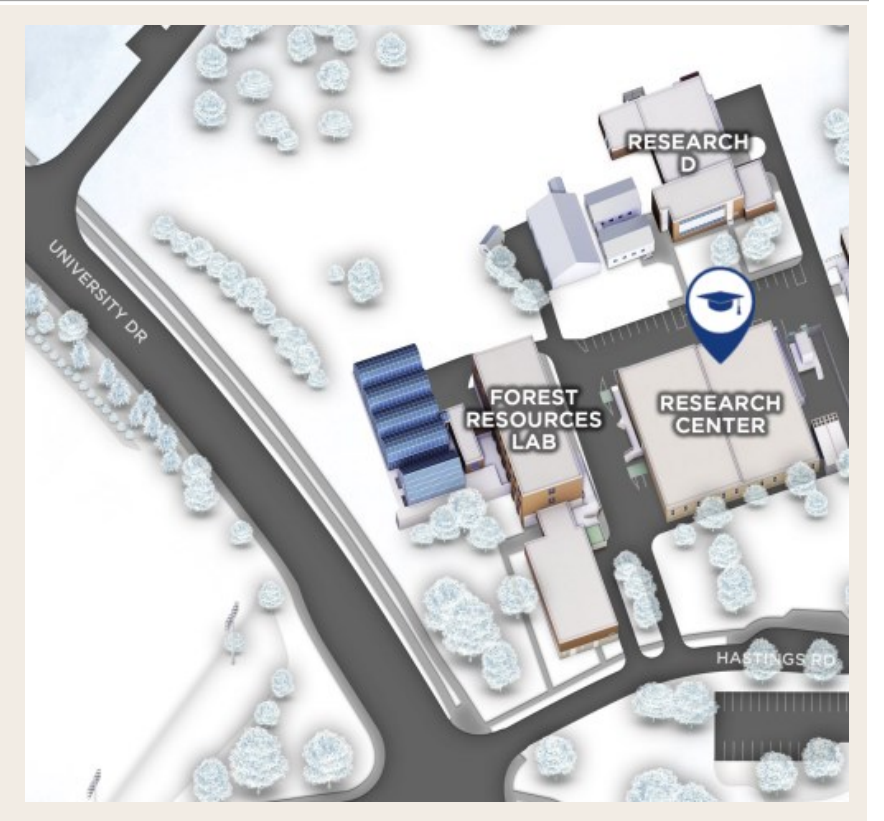
The graduation cap points to our new office in 108 Research Unit A Modular Lab — labeled Research Center

Penn State University PA/NJ TACF 108 Research Unit A Modular Lab University Park, PA 16802