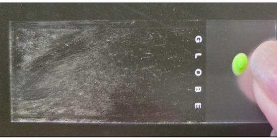
Figure 2. Frozen pollen will be distributed in vials like that shown to the left. Each capped vial will have four slides covered in pollen and will need to be kept frozen until use. The slide shown above has millions of pollen grains which appear "smeared" on the slide. These "disappear" as the slide is used and the person performing the pollinations will be able to see how much pollen is left. Each slide can be used to pollinated 10 -25 flowers.

accessible form of transgenic germplasm available and will allow those with flowering trees to make their own D58 derived seeds. Pollen will be sent in frozen form, captured on slides (Figure 2). Pollination kits which include at least 1 vial of pollen (enough to pollinate at least 100 flowers), isolation bags, twist ties, and instructions will be made available for purchase by those who have flowering trees to pollinate. The timeline and process for purchase will be determined by spring 2023.