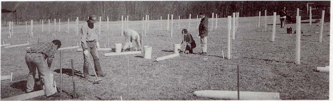
262 Chestnut Trees Planted at Reineman's Wildlife Sanctuary

DEDICATED TO THE RESTORATION OF THE MAJESTIC AMERICAN