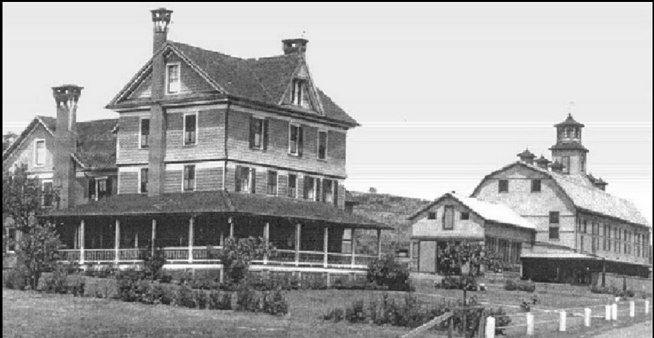
The Sober Chestnut Plantation house and Barn ( circa 1896) A major producer of the 'Paragon' Chestnut.