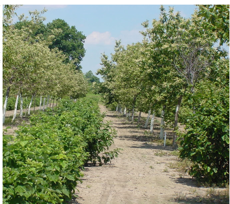
Figure 1. Chestnut trees interplanted with raspberry bushes on a commercial farm in Michigan.

So whether you're a landowner looking to increase the profitability, a hunter looking for a good wildlife tree, or simply a hungry person looking to eat some chestnuts, forest farming can help you.