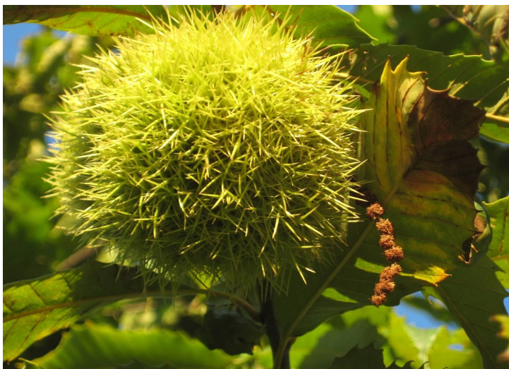
Photo of a selected BC3 tree at Red Clay Reservation in Hockessin, DE. Russ and several other volunteers worked to harvest over 1500 chestnuts from the Red Clay orchard this fall.

Want to see your photo in The Chestnut Tree? Please send your photos to mail@patacf.org