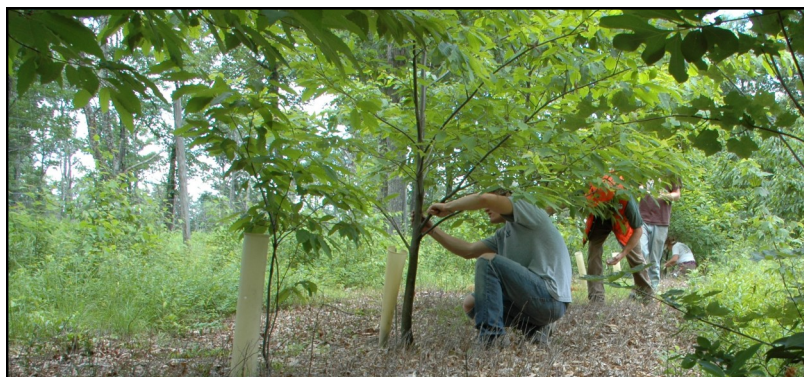
The inoculation crew challenges backcross trees at The Nature Conservancy's orchard in Hyner, PA.

Keeping in mind the differences across planting sites, there are a few more things to note about this table. First, the Survival** column is survival to inoculation. Second, the Inoc'ed* column notes the percentage of planted trees that were actually inoculated. Even though an average of 50% of planted trees make it to inoculation age, they may not be inoculated for reasons such as being too small (runty) or having too much blight or other damage. As you can see, the Chapter inoculates an average of about 20% of the trees it plants in its fourth-generation orchards.