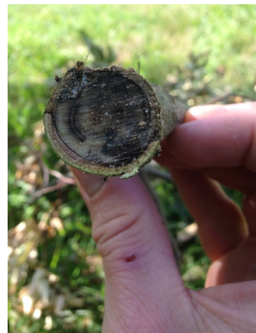
Cross-sectional view of ambrosia beetle infested stem.

Treatment The peak activity period for the granulate ambrosia beetle is during leaf out, which for our area occurs in March-June. Preventing infestation is difficult at best and especially so during leaf out. Most recommendations are to use a permethrin or bifenthrin-based insecticide applied liberally to the bottom 5