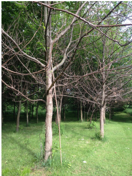
Beetle infested tree-early spring.

The first sign of trouble came in the spring with a few calls to the office - trees that had just begun leafing out were dying suddenly with shriveled brown leaves as well as trees not leafing out at all. The ten-year-old Chinese chestnut in my own backyard showed the same symptoms, ultimately dying by May. In June, there was evidence of the same problem in the arboretum: the trademark tiny holes ob-