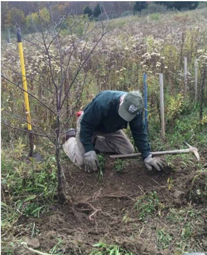
Digging up root system of a chestnut that died within the past two years. Note there are no stump sprouts.

The hole was backfilled with a mixture of oak forest soil and composted manure mixed with the native soil displaced by the auger. A chestnut was planted in each location and consisted of a mix of Chinese, American and some backcrosses.