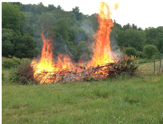
Burning beetle infested stems in arboretum.

Looking to the future there is no expectation for this pest to leave the area. The chapter is consulting with entomologists and tree care companies to develop a management strategy. The proposed plan is to treat our highest value trees that currently have evidence of beetle infestation in the hopes that these trees