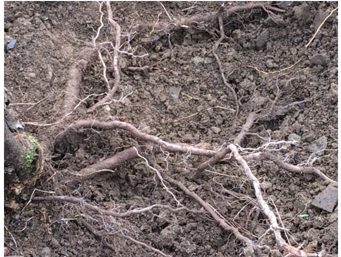
Close up of a strong root system that over ten years extended far beyond the edges of the au-

The trees grew well for several years, but over time, most of them died. Was root binding an issue? Ten years later one of the more recently dead trees was checked by digging up the root system.