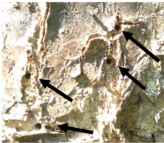
Close-up of beetle entrance holes in chestnut tree.

While this pest is not new, this summer saw a significant expansion of its range. The beetles themselves are tiny, less than 3mm in