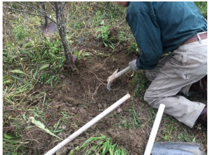
Close up of a strong root system that over ten years extended far beyond the edges of the augered hole .

The following pictures tell the story. Basically there was no problem with the roots extending beyond any barrier created by the augered hole. The site does have issues with high moisture due to a spring located further up the hill. This has to be considered as a factor that limited the growth of chestnuts, but the effect of using an auger to plant the seeds can be ruled out.