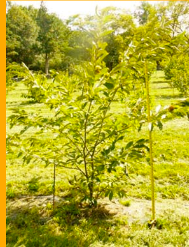
Blandy orchard backcross tops 5 feet in three seasons