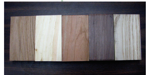
Wood blocks from the Learning Box. Can you identify them?!

The new display will be featured at our upcoming Annual Meeting.