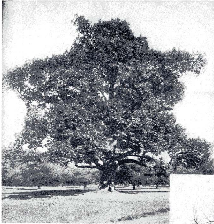
Open-grown American Chestnut develops a broad, somewhat pyramidal crown, supported on a short thick trunk

THE American chestnut, which has given joy to so many people, is practically doomed by a disease, but continues sufficiently important to command attention among American trees. Before the chestnut blight gained its present headway, chestnut was found from southern Maine through-