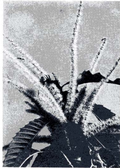
Massachusetts Horticultural Society

There are other enemies of the chestnut but in comparison with the blight they are all of secondary importance. No adequate method of control has been developed, and in spite of constant search, no strain of blight resistant American chestnut has been discovered.