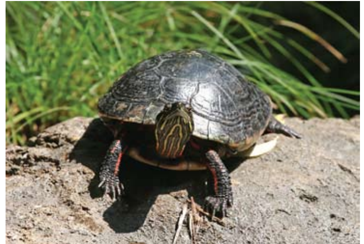
Taking a closer look at the plants and animals that live in wetlands can reveal many things. Cattails (left) produce thousands of seeds that spread by wind and water, and turtles (right) have scaly legs shaped like paddles for swimming.

swamps, and marshes are all special kinds of wetlands.