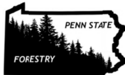
(Left Breast Logo)